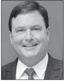
Attorney General Todd Rokita

"Like most Hoosiers, I believe in building a culture of life in Indiana," Attorney General Rokita said. "That means protecting the lives of unborn babies and safeguarding the physical, mental and emotional well-being of their mothers. I'll do everything in my power to advance this mission."